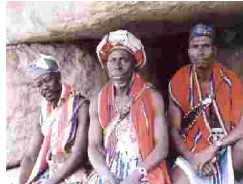
Chieftaincy in Tongo, a Rich Culture