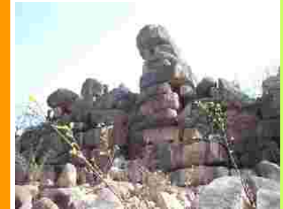
Dramatic Granite Rock Formation