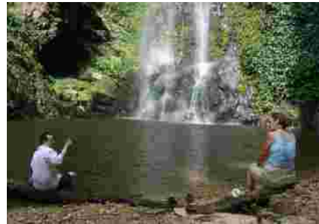
A welcoming pool at the base of Tagbo Falls