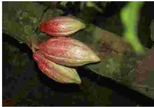
A fresh cocoa pod on tree

By Lorry from Accra, board a vehicle at Tudu to Hohoe or the Tema Roundabout to Hohoe